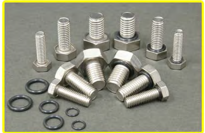
Hex Head Bolt